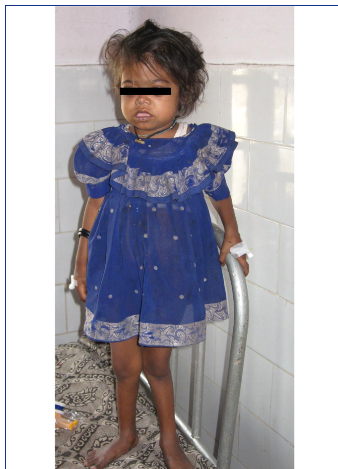
[Table/Fig-1]: Four year old girl with osteopetrosis having oedema of the legs and face.

Her blood cultures did not show any growth. Her bone marrow aspiration ended in a dry tap twice. Based on these findings, myelophthisic anaemia which was secondary to osteopetrosis was made. Kala Azar was ruled out by the RK-39 test, as the patient