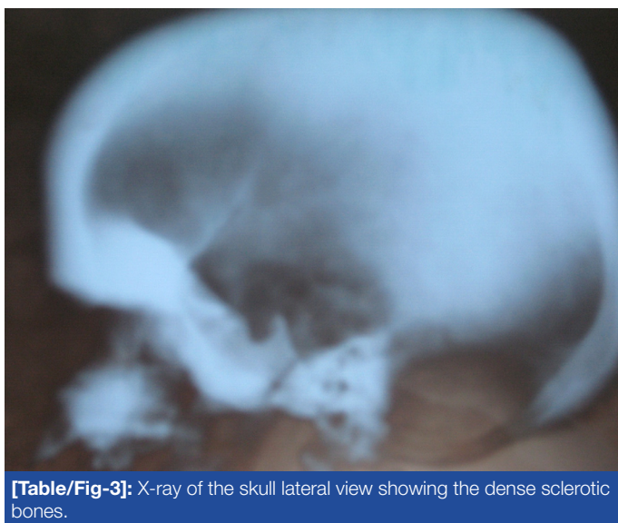
[Table/Fig-3]: X-ray of the skull lateral view showing the dense sclerotic bones.

immature bone [1]. It causes abnormal formation of the medullary cavities, resulting in bone marrow failure. Abnormal resorption of the bones cause narrowed cranial nerve foraminas, resulting in various cranial nerve palsies, namely those of the optic, auditory and the facial nerves. Due to the abnormal remodelling of the bones, they are prone for repeated fractures. The types of osteopetrosis are namely, the type with an infantile onset or the autosomal recessive type; the adult onset or the autosomal dominant type and the carbonic anhydrase deficiency type. The presentation of the disease varies according to the type. The infantile onset disease usually presents within the first year of life. Visual impairment, failure to thrive, frequent infections and secondary bone marrow